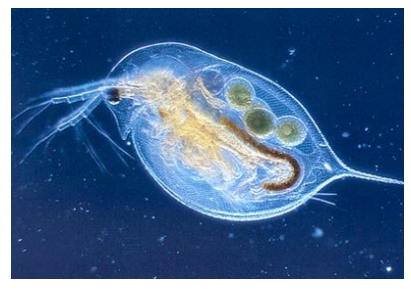
Figure 3. Daphnia s.p. is a crustacean used in aquaculture nutrition.

This research project will assess the potential of microalgal-bacterial systems for the biodegradation (carbon and nutrients removal) and biomass production from agroindustrial wastewaters. More specifically, the symbiotic mechanisms between algae and bacteria, the elucidation of the inhibitions caused by the wastewater and the determination of the potential nutritional limitations will be investigated. In addition, the optimization of photobioreactor design and operation in order to maximize C and nutrients removal will be studied. Finally, the potential of the residual algal-bacterial biomass produced will be evaluated as biofertilizer and as a supplement for Daphnia sp. (figure 3) nutrition.