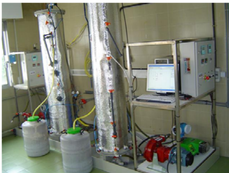
Figure 2. Pilot plant for sludge digestion and microaerobic removal of H 2 S.

Recent research has shown that controlled oxygen supply to AD can modify some of the transformations produced in the anaerobic environment while methanogenesis is not affected. This fact opens a wide research field to modify undesirable situation and preserve methanogenesis and organic matter removal. For example, limited oxygen supply to the bioreactor, thus creating microaerobic conditions, can provide a better environment to deal both with hydrogen sulphide production and intermediate accumulation.